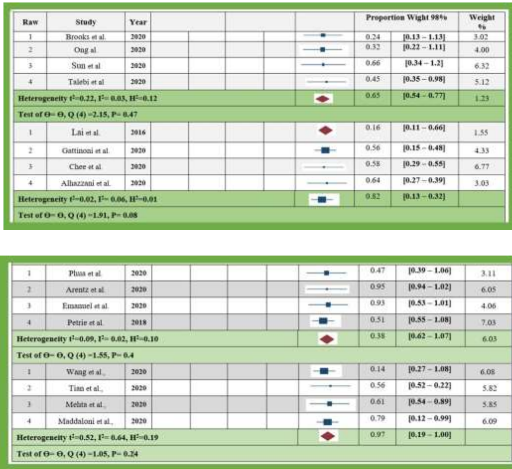
Figure 6. Forest plot showed Covid-19 for elderly people