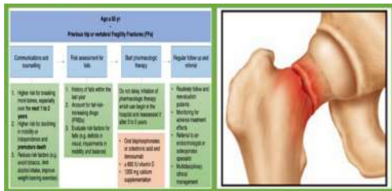
Figure 3. Causes of hip bone fracture in the elderly

Symptoms of a hip fracture in the elderly may include: X-rays may show the fracture.