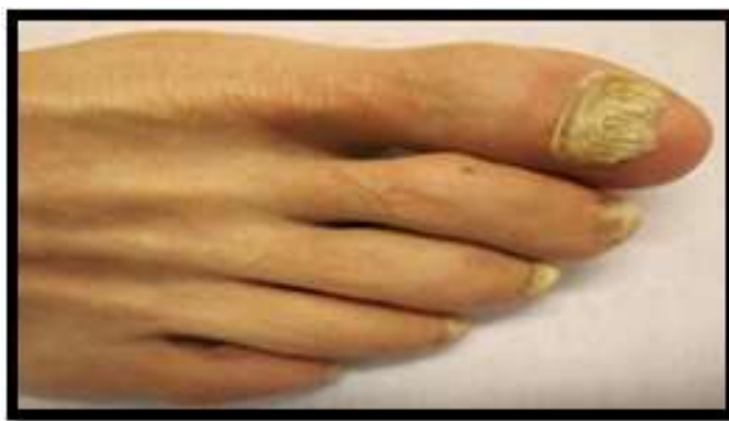
Fig No: 02 onychomycosis

One-third of integumentary fungal infections and half of all nail diseases have been linked to onychomycosis. The fungus that has infected your nail can potentially spread to other parts of your body and possibly to other people. Onychomycosis is more than just a cosmetic issue, despite the fact that those who have it are typically ashamed of their disfigured nails. Due to their limitations on mobility, these infections may impede peripheral blood flow, aggravating already severe diseases including venous stasis and diabetic foot ulcers. [12]