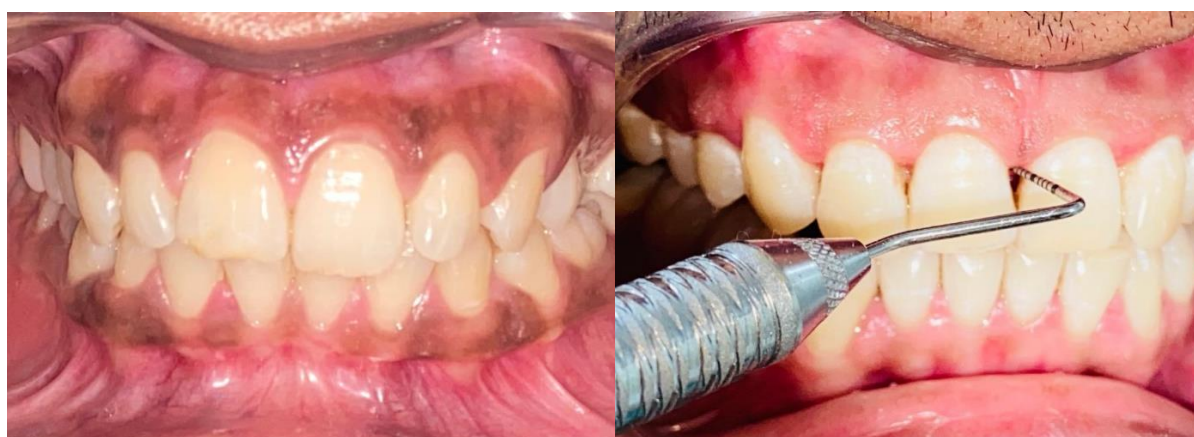
Figure 1. A. Normal interdental papilla. B. Black triangle between maxillary central incisors.

Interdental papilla is a part of gingiva which occupies embrasure area. Loss of interdental papilla (Figure 1) leads to a condition known as “Black triangle”. Black triangles are rated as the third most disliked esthetic problem after caries and apparent crown margins. 1