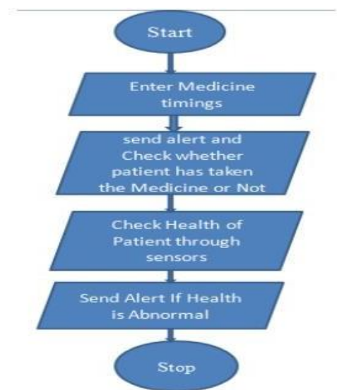
Fig.2. Flowchart for the System